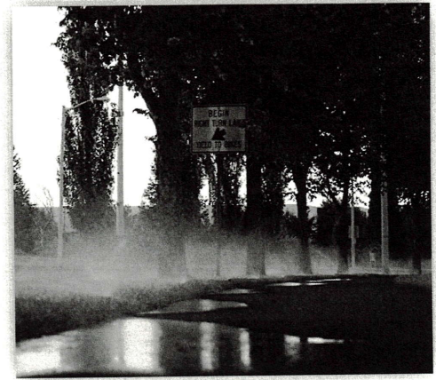
Figure 2. Sharing lawn irrigation.

A similar but more durable option is plastic tubing with drip emitters inside it at regular intervals. This is sometimes called "drip tape" or "dripline." Ideally the tubing would be run in a circle around the tree near its drip line.