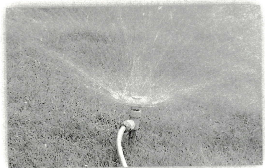
Figure 3. Hose and sprinkler.

A hose and sprinkler are an effective way to water trees. [Figure 3] A hose and sprinkler should always be used when the lawn irrigation system is turned off. Place several cups in the pattern of the sprinkler to collect output or attach a water meter to the hose to determine how much water was applied. The most effective place to water mature trees is just outside the dripline, NOT at the trunk. Depending on the type of sprinkler, it may take thirty to sixty minutes of run time to apply one inch of water.